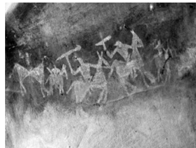
Cave Painting in Bhimbhethka

Sanskrit the mother of all languages peaked with its poetic marvels Ramayan and Mahabharat ( Panchtantra is also a milestone that can’t be ignored )these epics