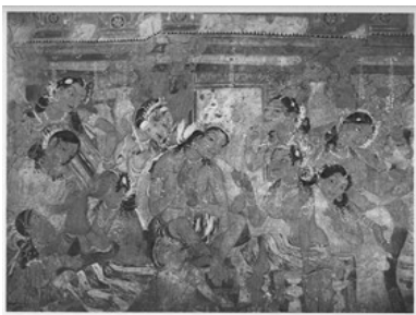
Ajanta Cave Painting

Poetry has been an integral part of Indian society since its beginning. Indian scriptures, manuscripts, and religious texts have been mostly portrayed in the form of poetry . Even in the West majority of movements are directly proportional to literary movements.